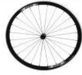
XFF07000 Proton wheel