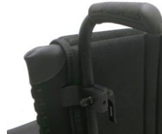
XFF 030204 Push handles, height-adjustable