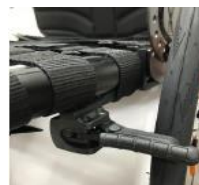
XFF060024 Lightweight compact brake EVO