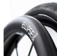
XFF070212 Handrims Ellipse 3R