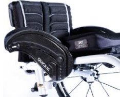
XFF040104 Carbon fibre, cold weather protection, fender