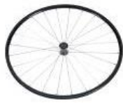
XFF070003 Lightweight wheel