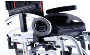
XFF04000x Desk sideguard, armpad, flip- up, removable