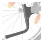
XFF090001 Tip assist