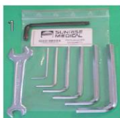
XFF090000 Tool kit