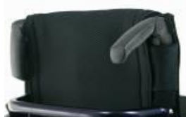
XFF 030203 Push handles, fold-down