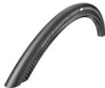
XFF070107 Schwalbe One