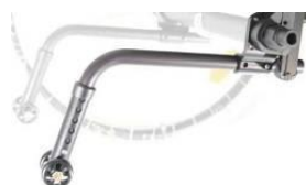
XFF090050 Anti-tip tubes, plug in, pair