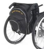
XFF090030 Back pack