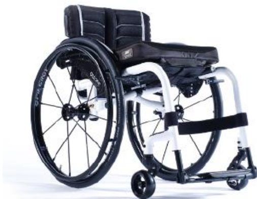
XFF010012 / 13 Open Frame