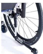
XFF090004 Anti-tip tubes, swing away