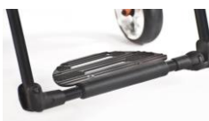
XFF050059 Footboard platform, performance