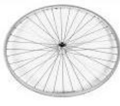
XFF070002 Design wheel