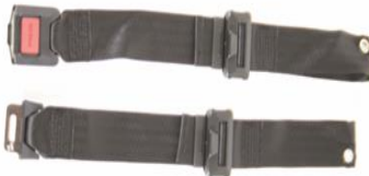
XFF 090018 Lap belt with buckle, metal