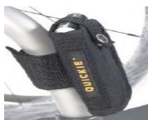
XFF090026 Mobile phone pocket