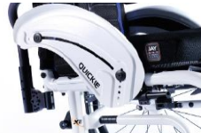
XFF040103 Aluminium, cold weather protection, fender