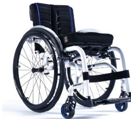
XFF090020 / 21 Hybrid frame