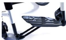
XFF050027 Footboard platform, lightweight, carbon fibre, auto folding